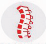
Spinal Deformity Correction