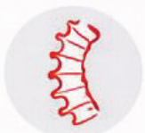
Spinal Fixation Surgeries