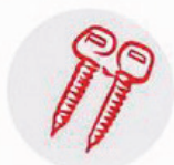
Pedicle Screw Placement