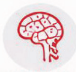
Tumour & Trauma Surgeries